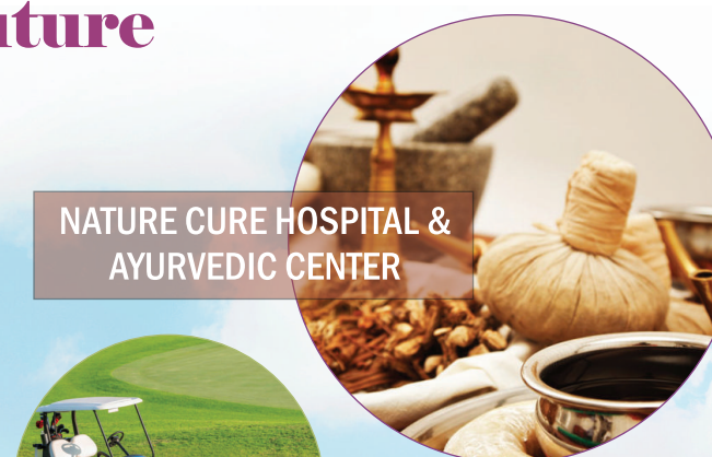
NATURE CURE HOSPITAL & AYURVEDIC CENTER