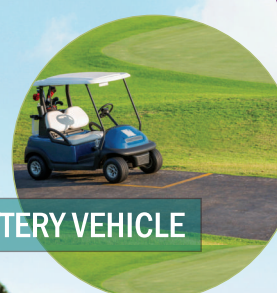
ELECTRIC BATTERY VEHICLE