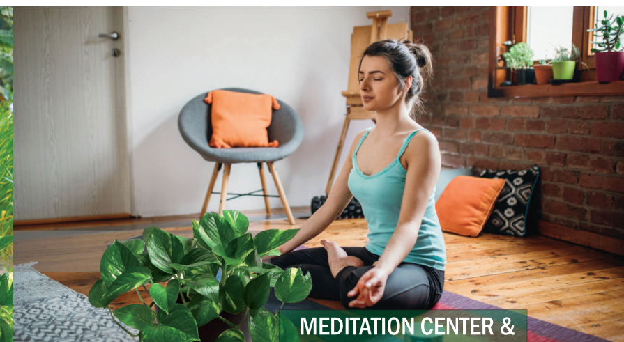
MEDITATION CENTER & HEALING CENTER